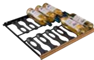
Sliding shelves up to 12 bottles