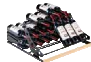
display shelves up to 32 bottles

The space between the shelves is designed to protect your bottle labels , especially those of Champagne bottles.