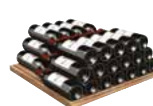
storage shelves up to 77 bottles